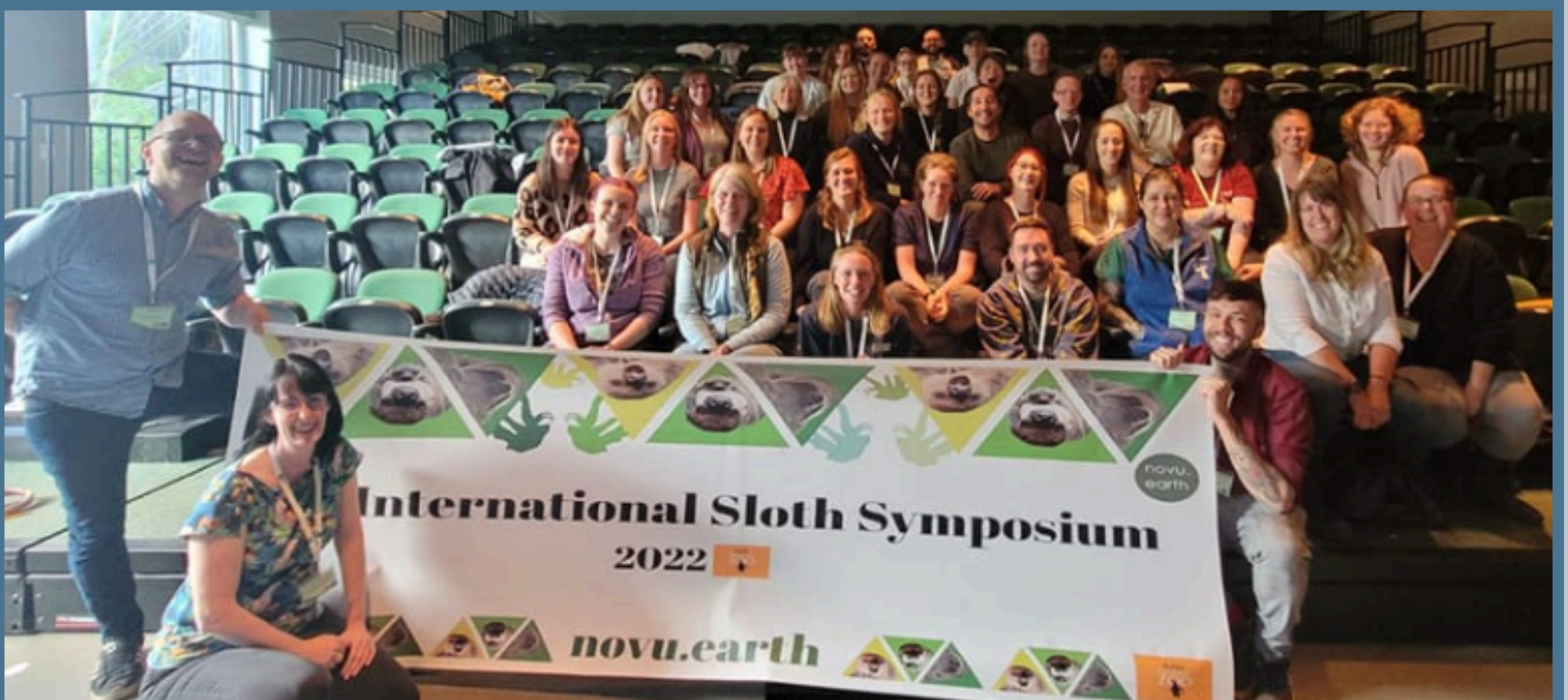
Edinburgh Zoo 2022.

The 2nd Symposium in October 2023, held at the Audubon Zoo in LA, USA, welcomed 80 more delegates and additional representatives from three in-situ conservation organizations in home countries. In 2024, delegates joined us at the Chester Zoo, England, where the Symposium grew from two-days of husbandry and conservation to three days with a full schedule of sloth veterinary care..